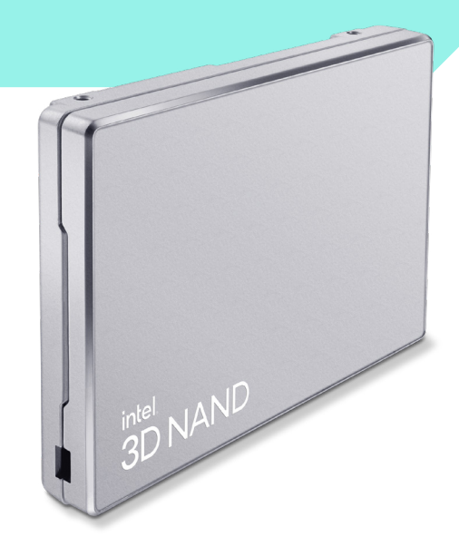
Figure 2. The NVMe-based Solidigm SSD D5-P5316 can be used as affordable, reliable capacity storage in DataON Integrated Systems for Azure Stack HCI

Solidigm offers a wide variety of high-performing NVMe drives designed to meet a wide range of needs, based on applications, workloads, and usage. As a result, Solidigm TLC NAND and QLC NAND NVMe SSDs can be combined into an efficient and cost-effective all-flash design for software-defined storage. For example, organizations can deploy a DataON solution configured with an efficient multitier architecture built on NVMe TLC NAND SSDs (such as the Solidigm SSD D7-P5600 series, Solidigm SSD DC P4600 series, or Solidigm SSD DC P4610 series (formerly Intel) as a cache tier for reads/writes in front of higher capacity, affordable Solidigm SSD D5-P5316 QLC NAND drives (formerly Intel) as an all-flash tier for capacity storage.